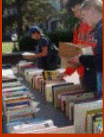
WoZhaWa Book Sale Friday & Saturday 9-4